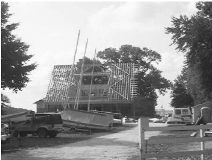
DELTAVILLE- The latest view as you approach the club on Fishing Bay Road.