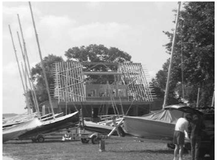
DELTAVILLE - Another view of the new clubhouse as you enter the east entrance