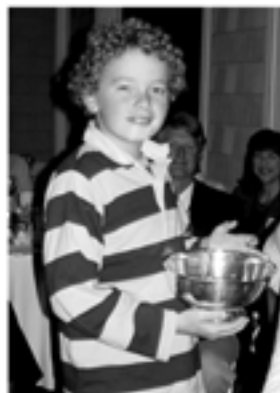
William Wirt L. Wood Bedell Trophy