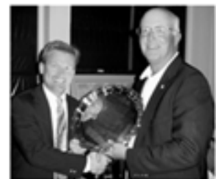
Mike Dale Sportsmanship Trophy