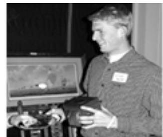
William Fowler All B. Fine Trophy