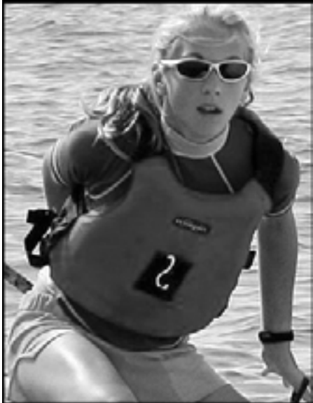
(ACC Championship continued from page 10 )