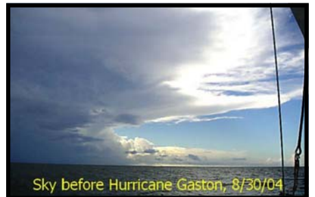
Sky before Hurricane Gaston, 8/30/04

For Sale: Dinghy. One well used inflatable dinghy and 5 hp Evinrude motor. Foot pump, oars, gas can come with it. Call Ric @ 804-644-0049 or 804-769-4293