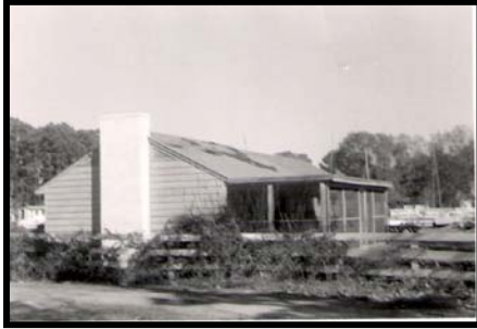
Roof Damage 1954

Nearly 50 years before Hurricane Isabel wrought her destruction on the Fishing Bay Yacht Club and its environs, Hurricane Hazel held the dubious reputation of being the “baddest” storm in our club’s history. On October 1954, 1954, Hazel made landfall on the North Carolina/South Carolina border with 110 mph winds with highest estimated gusts of 140-150 mph. With a remarkably similar track to Isabel, she spiraled north through central and southeast Virginia with devastating results to the Chesapeake Bay. Her destructive path took her all the way to Canada before she significantly diminished in intensity.