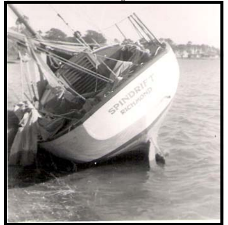
Spindrifft Beached 1954

There was one major difference between Hazel’s era and Isabel’s era. Back in the 1950s, some of the club yachts were on permanent moorings in Fishing Bay. Obviously, Fishing Bay could not offer the same protection as Jackson Creek and the moored boats were beached in the storm.☐