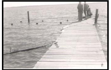
Pier Damage 1954