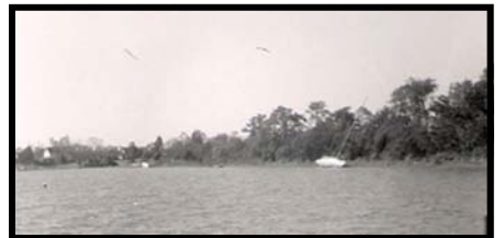
Ravaged Fishing Bay Shoreline 1954

Pictures After Isabel Below: Left to Right—Deltaville Marina, FBYC Dock on Jackson Ck, FBYC Doick on FB