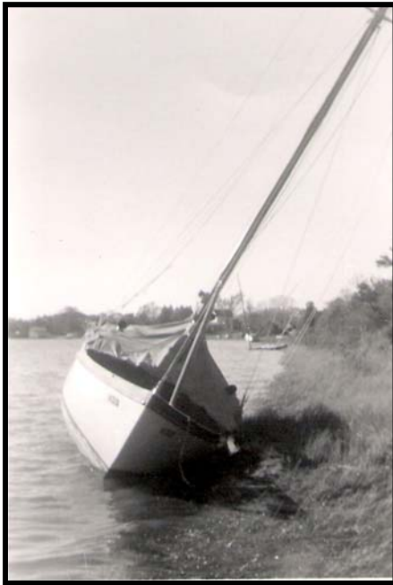
Beached Yacht 1954