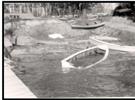
Shore Damage 1954