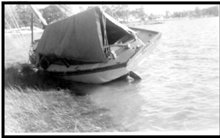
Sea Fever Beached 1954