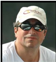
2006 FBYC Officers