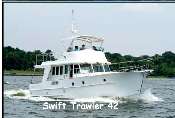
Swift Trawler 42