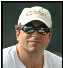
2006 FBYC Officers