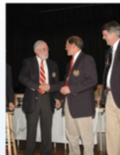
2006 Annual Dinner