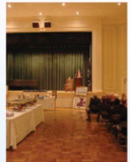
2006 Annual Dinner (see page 6)

At the end of the 2006 club year, the Board voted to approve some changes to our membership and dues structure. This necessitated some changes to the Bylaws which you will see in the Minutes in this issue. This was the culmination of a year of looking at the club and our future that included the Membership Survey and completion and publication of the Long Range Plan, and the work of a committee appointed by the Commodore to review our membership classifications and dues structure. (continued on page 4)