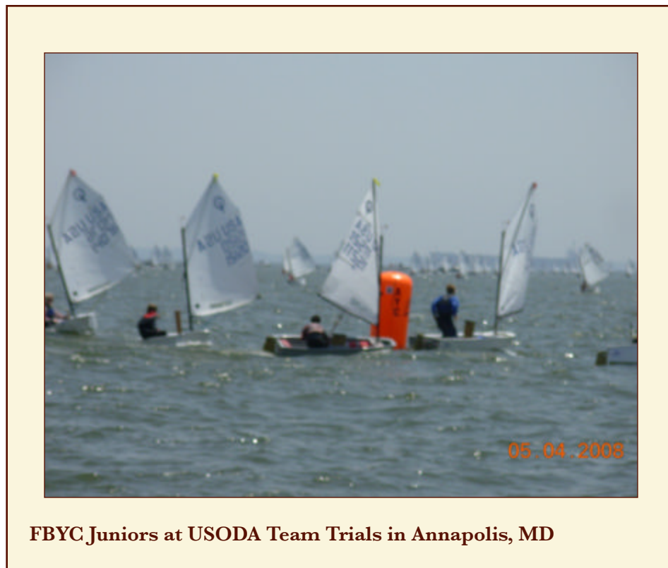
FBYC Juniors at USODA Team Trials in Annapolis, MD

As registration for FBYC's Junior Week (June 16th – 20th) came to a