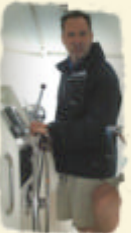
Jim Morrison Log Streamer