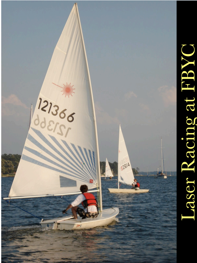
Laser Racing at FBYC