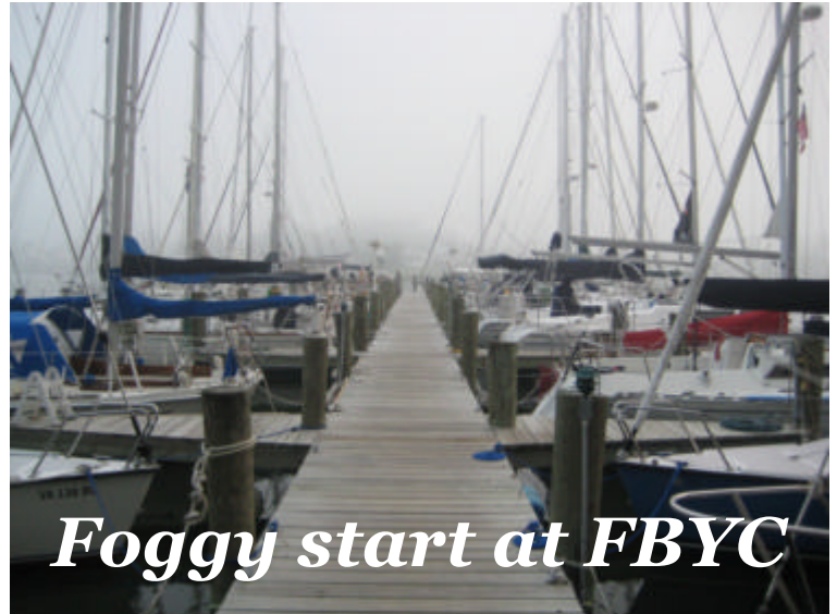
Foggy start at FBYC

We had some pretty exciting wind in Spring Series 3 and 4. In Spring Series 3 a Flying Scot with two board members and a new member went over. We, I mean they, only lost one pair of eyeglasses. Spring Series 4 was supposed to be in conjunction with the One Design Challenge to benefit research for a cure for leukemia, lymphoma and meyloma. The weather didn't cooperate. The One Design Challenge was postponed to combine with Summer Series 2 on July 5. However Spring Series 4 was still held with a limited number of participants, 2 chase boats plus the Junior Coach. We had Flying Scots, one Front Runner, that went over, three Laser Radials, two 420's, two Optis and one Lightning. Before the shippers' meeting, I asked Eric Powers, Junior Division Commander, what the juniors (the 420's and Opti's) wanted to do. Eric responded that they came to race. With that spirit, you can see why the Juniors do so well. And that they did. Please check the website for upcoming events. We have 3 summer seabreezes coming up with starting times at 1:00PM. August 9 and 10 is the Annual One Design Regatta. See you on the water.