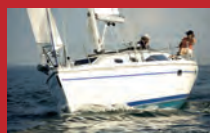
2009 Catalina 350 $189,499

CALL ABOUT OUR FANTASTIC FIRST YEAR BONUS!!