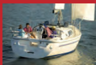
2009 Catalina 309 $106,998