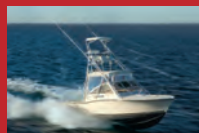
2009 Carolina Classic 28' $198,808

Chesapeake Yacht Sales located at Deltaville Yachting Center