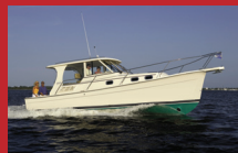
2009 Mainship Pilot 31 $209,000