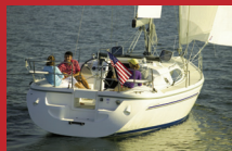
2009 Catalina 309 $106,998