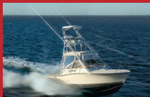
2009 Carolina Classic 28' $198,808

Chesapeake Yacht Sales located at Deltaville Yachting Center