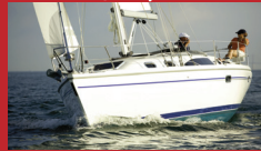
2009 Catalina 350 $184,499