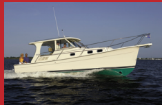
2009 Mainship Pilot 31 $199,000