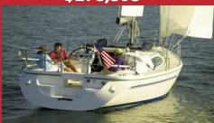
2009 Catalina 309 $104,998