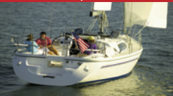
2009 Catalina 309 $104,998

Grand Prize Drawing One Week Sunsail Flotilla Charter in the BVI