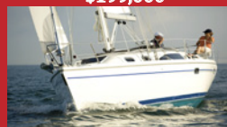
2009 Catalina 350 $184,499

Grand Prize Drawing One Week Sunsail Flotilla Charter in the BVI