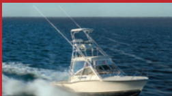
2009 Carolina Classic 28 $178,808

Chesapeake Yacht Sales located at Deltaville Yachting Center