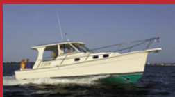
2009 Mainship Pilot 31 $199,000

2009 Year Model Price Savings! Join us for DELTAVILLE DEALER DAYS MAY 1 & 2