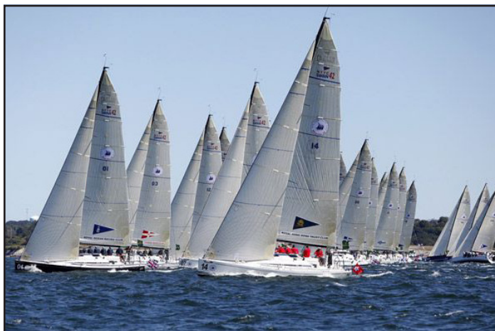
Swan 425 Race in NYYC Invitational