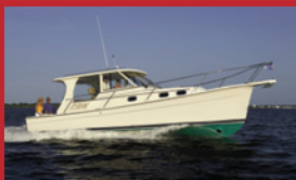
2009 Mainship Pilot 31 $189,000