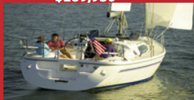
2009 Catalina 309 $99,900