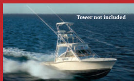
2009 Carolina Classic 28 $169,950