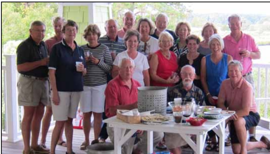
A beautiful evening for 18 FBYC cruisers at Cape Charles