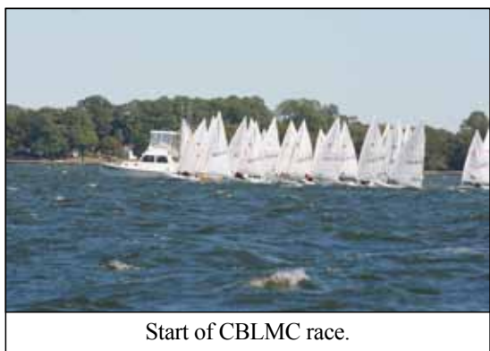
Start of CBLMC race.