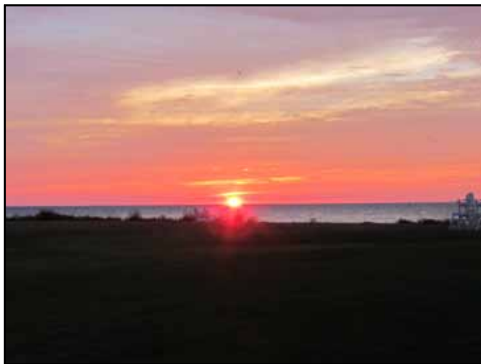
Sunset at Cape Charles

Koedels & Bennetts spent 2 days at Norfolk Yacht & Country Club with 10+ inches of rain and 40 + knots of winds. If you ever need to be away from home NY&CC is great! Strong floating docks, good club food and first class showers.