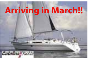
2011 Catalina 355 $199,489 (includes freight & commissioning)