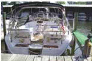
2007 Hunter 38 $159,950 Like New!

Large Inventory Pre-owned Power & Sail (877) 218-1575 www.cysboat.com