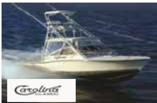
2009 Carolina Classic 28 $169,950