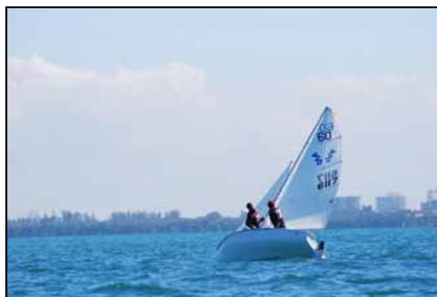
36th Annual Orange Bowl International Youth Regatta

http://www.coralreefyachtclub.org/gui/coralreefyc22244/pageimages/Orange_Bowl_Regatta/Copyof420race8.pdf