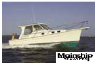
2009 Mainship Pilot 31 $189,000