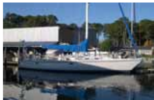
1992 Catalina 42 $119,500