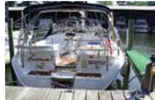
2007 Hunter 38 $149,950

Large Inventory Pre-owned Power & Sail (877) 218-1575 www.cysboat.com