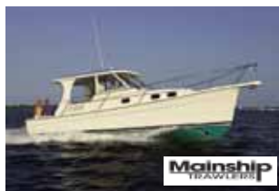
2009 Mainship Pilot 31 $189,000