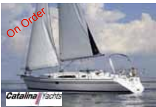
New Catalina 355 $209,978