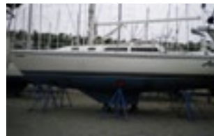
1993 Catalina 30 $45,000

Large Inventory Pre-owned Power & Sail (877) 218-1575 www.cysboat.com