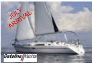
New Catalina 355 $209,978