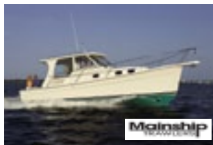
2009 Mainship Pilot 31 $189,000