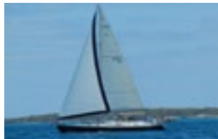
1998 Hylas 46 $319,000