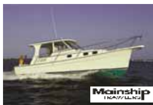
2009 Mainship Pilot 31 $189,000