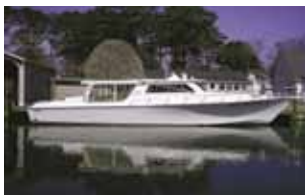
'04 Chesapeake 48 $299,000