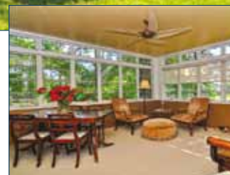
Every Room Has a Water View! Charming Sunroom!