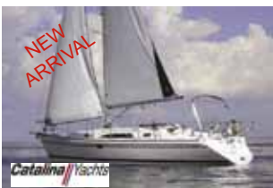
New Catalina 355 $209,978