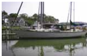
1980 Whitby 42 $99,900

Large Inventory Pre-owned Power & Sail (877) 218-1575 www.cysboat.com