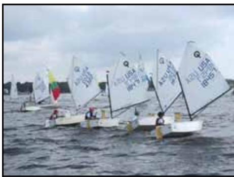
Blue Fleet going out