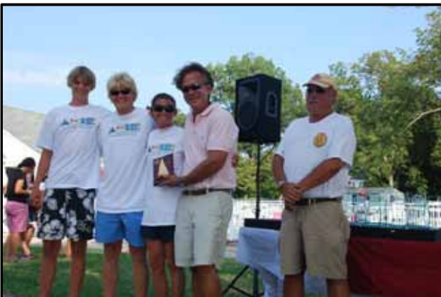
Cat's Pajamas 2nd in J24 Fleet