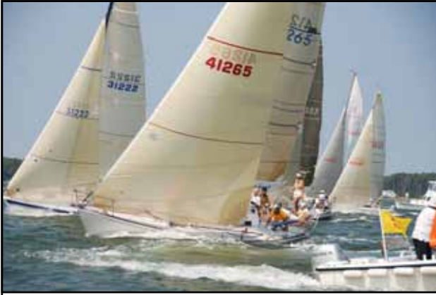
PHRFB Fleet start