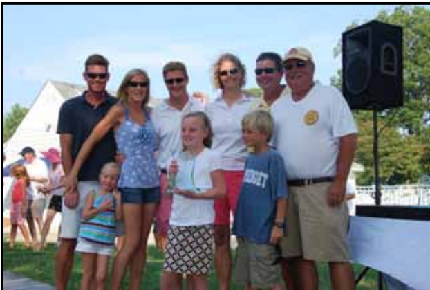
She Crab Soup J105 Fleet Winner