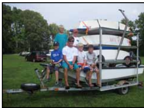
Opti Development Team