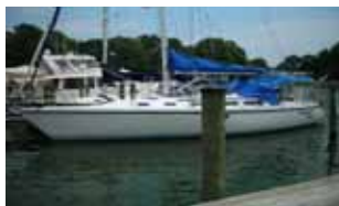
1991 Catalina 42 $119,950

Large Inventory Pre-owned Power & Sail (804) 776- 9898 www.cysboat.com