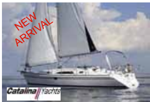
New Catalina 355 $209,978