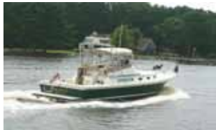
2000 Albin 32+2 $139,000