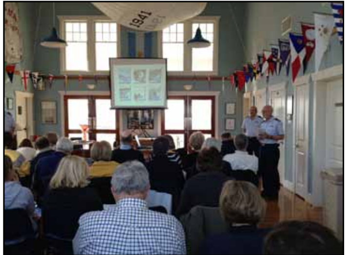
Virginia Boating Safety Education Course presented by Flotilla 66 of the US Power Squadron on March 10, 2012.