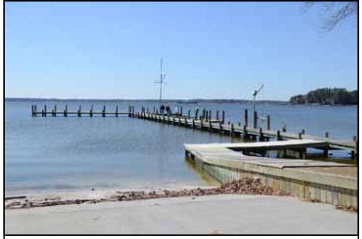
Fishing Bay Dock Extension - Just add boats!