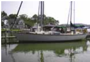
1980 Whithy $ 89,900