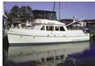
1986 Eagle $79,900

Large Inventory Pre-owned Power & Sail (804) 776- 9898 www.cysboat.com