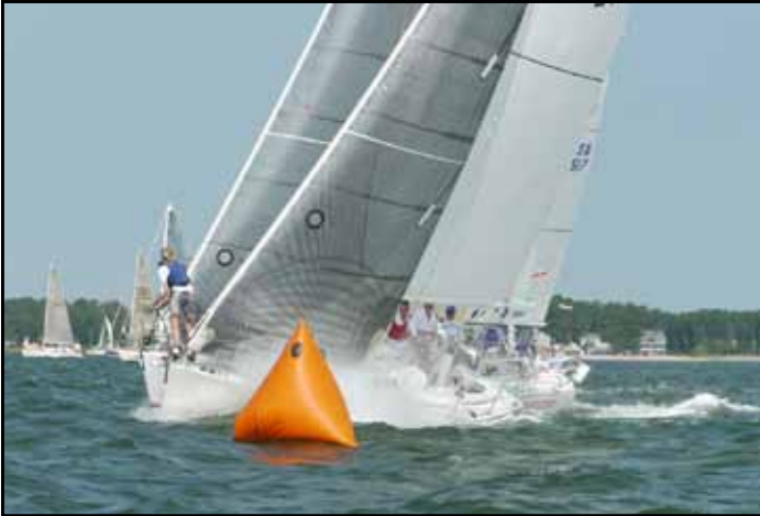
Are you ready for the Spring Series?