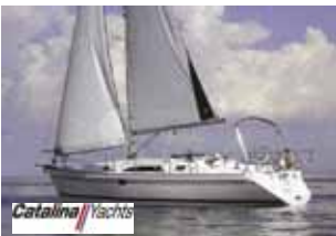
New Catalina 355 $209,978