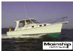
'09 Mainship Pilot 31/355 $183,474