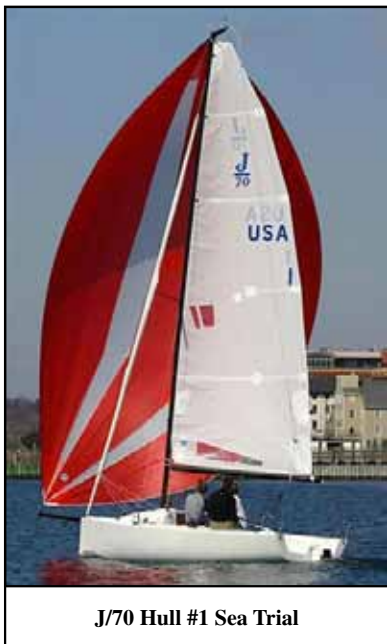
J/70 Hull #1 Sea Trial

Thank you for your support. We hope many of you will attend this exceptional spectator event.