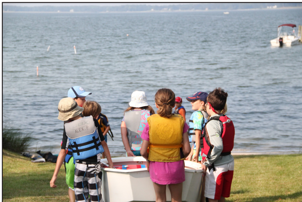
Junior Week Teamwork

Make checks payable to: FBYC, P.O. Box 29186, Richmond, VA 23242