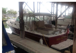
2001 Mainship 30' $62,500

Deltaville The Boating Capital of the Chesapeake Large Inventory Pre-owned Power & Sail (804) 776- 9898 www.cysboat.com