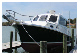
2006 Mabry 32' $127,500