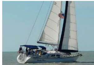
2005 Catalina 44' $254,000