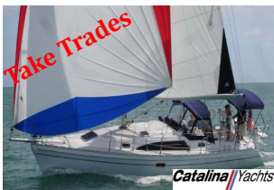
New 2014 Catalina 315 $133,012