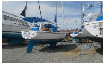
1990 Catalina 30' $49,995