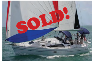
New 2014 Catalina 315