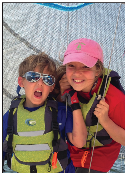
Smiles after the race.

For all our concern about the well-being of the kids, they handled the race without ANY issues at all. There was no "horseplay" or other frowned upon "kid-like" behavior. I was so impressed with their ability to handle the conditions and the value they added. Not only did they sail well, they were all smiles and excitement. They really loved being out there.