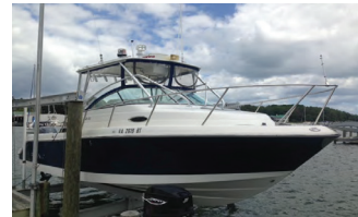
2009 Robalo 24' $54,000