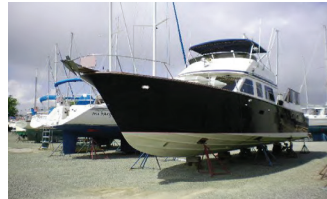
1987 Albin 48' $74,500