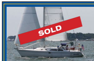
2002 Catalina 36 Mk II 'Reveille' $94,500