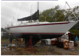
1986 Ericson MKII 28' $19,000