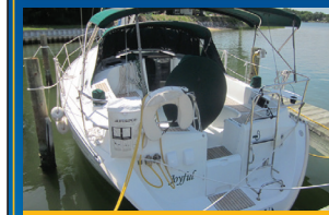
2004 Beneteau 361 'Joyful' $95,000