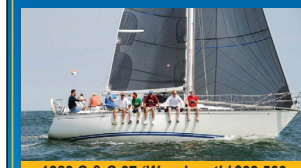
1983 C & C 37 'Wavelength' $33,500