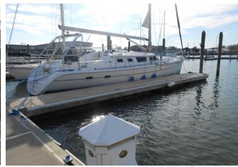
2004 Hunter 42' $159,950