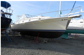
2004 Mainship 34' $123,900