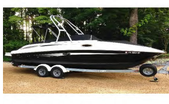
2009 Sea Ray 26' $49,995

Deltaville Dealer Days Boat Show May 2 & 3, 2015 10 am-4 pm