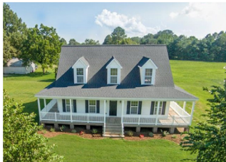
186 Lover's Lane

This beautiful, open concept home located on a 1/2 acre lot in the heart of Deltaville features fresh paint, new carpet, and re-finished hardwood floors. Walk to marinas, shopping, and restaurants, or spend time outside on the full wraparound country porch or barbecuing on the rear deck. There is a 1st floor master bedroom with walk-in closet and private bath as well as two additional spacious bedrooms upstairs. Cozy up in front of the gas fireplace with marble surround (never used!) in the great room, whip up something tasty in the granite kitchen with a center island, or get to work in the office on the second floor. Owner/agent owned. Offered for $248,500.