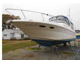
2000 Sea Ray 31' $49,900