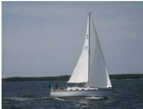
1979 Bristol 29' $24,500