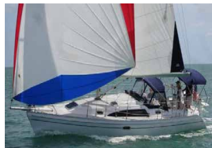
New 2015 Catalina 315 $137,153