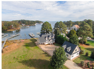
261 Lover's Lane

This custom-built, waterfront home offers views of Jackson Creek, the mouth of the Piankatank River, and the Chesapeake Bay. Dock your boat in one of the three slips at the multi-tiered dock that skims the 7' of water depth and has a 12,000lb boat lift. The custom eat-in kitchen shines with granite counters and stainless steel appliances, and opens to the gracious family room with a soaring tongue and groove ceiling and anchored by a wall of windows perfectly framing the picturesque water view. Two 1st floor bedrooms, plus a spacious master suite upstairs. The two car garage doubles as a guest or in-law suite with a fully finished apartment upstairs. Offered for $875,000