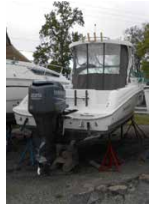
2005 Wellcraft 23' $29,500