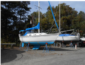
1988 Pearson 31' $29,900