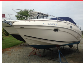
2002 Rinker 25' $18,900