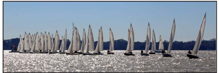
41 Scots on the starting line.