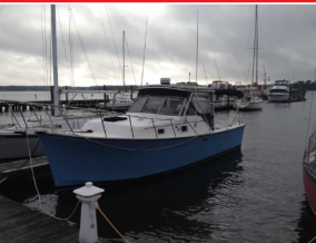
1989 Luhrs 30' $23,500

Deltaville Dealer Days Boat Show May 7th & 8th