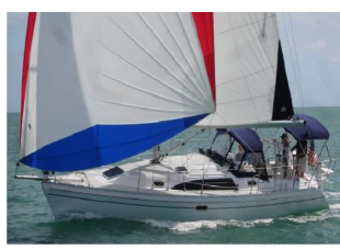
New 2015 Catalina 315 $137,153

Deltaville Dealer Days Boat Show May 7th & 8th