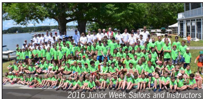
2016 Junior Week Sailors and Instructors