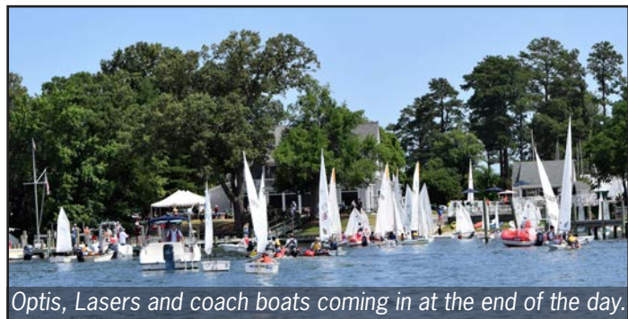
Optis, Lasers and coach boats coming in at the end of the day.