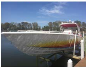
2007 Concept 36' $99,500