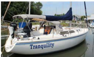
1992 Catalina 36' $49,999