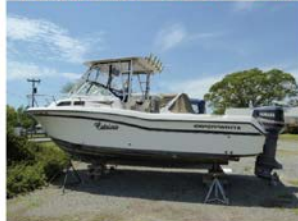
2000 Grady White 25' $21,950