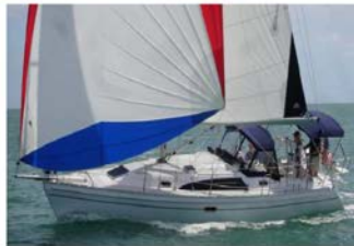
2015 Catalina 315 $137,153