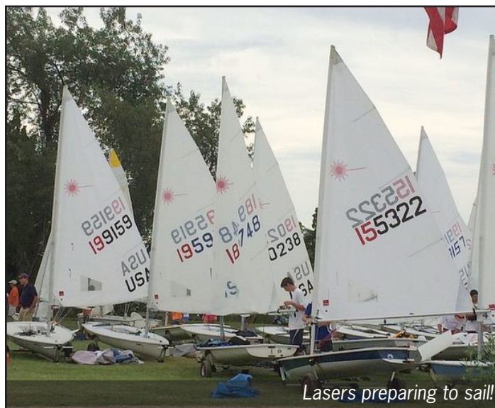
Lasers preparing to sail!