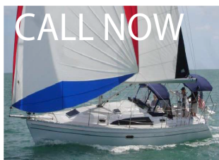
NEW 2015 Catalina 315 Just Reduced! $129,890