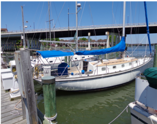
1978 Bristol 40' $35,500