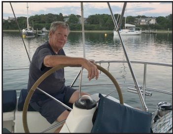
Enjoying a cool evening in Edgartown, Martha's Vineyard.