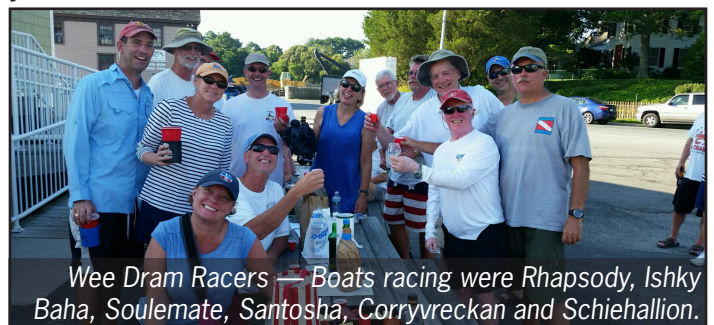
Wee Dram Racers — Boats racing were Rhapsody, Ishky Baha, Soulemate, Santosha, Corryvreckan and Schiehallion.