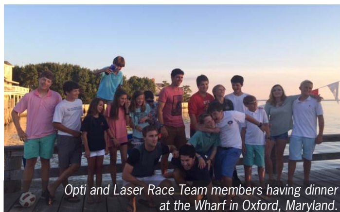
Opti and Laser Race Team members having dinner at the Wharf in Oxford, Maryland.