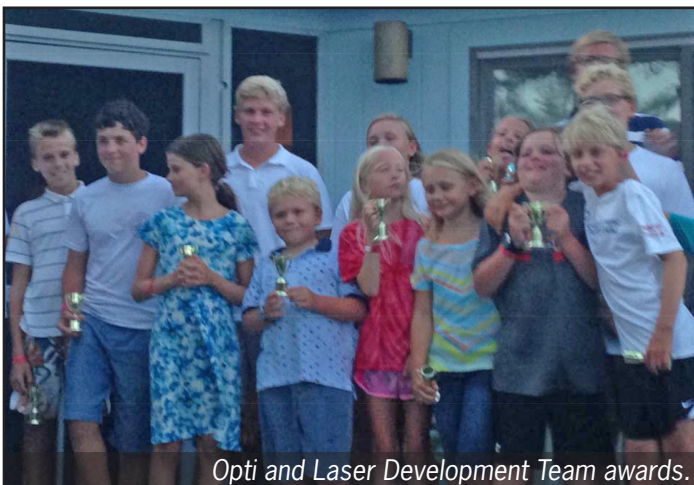
Opti and Laser Development Team awards.