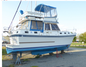
1986 Albin 34' $28,500