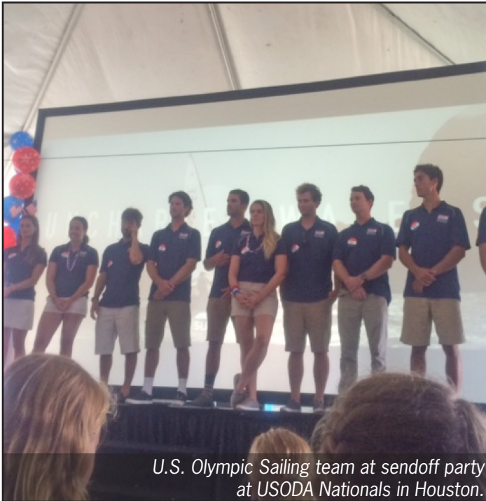
U.S. Olympic Sailing team at sendoff party at USODA Nationals in Houston.