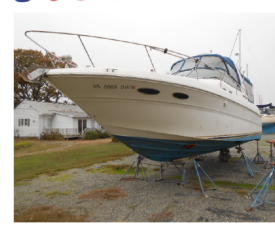
2000 Sea Ray 31' $44,500