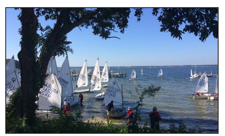
Development Teams launching from the Junior Ramp at FBYC.