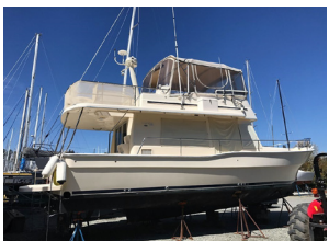
2004 Mainship 40' $194,000