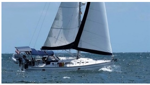
2001 Catalina 40' $144,500