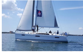
2017 Catalina 425 $333,583