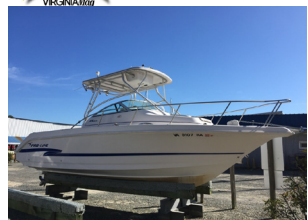
2003 Proline 24' $17,000

All Pricing Valid NEW OR USED Price Reductions 4/14/2017 JUST DO IT May Occur