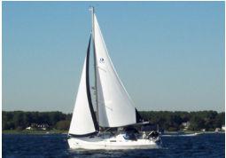
2006 Hunter 38' $114,999