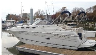
2001 Regal 26' $23,500