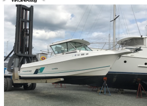
1995 Aqua Sport 24' $12,000

All Pricing Valid NEW OR USED Price Reductions 7/15/2017 JUST DO IT May Occur