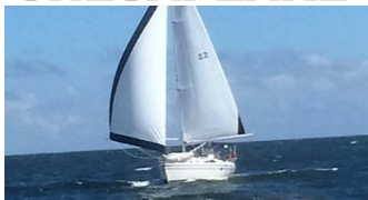
2009 Catalina 37 $167,900