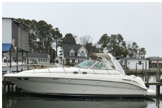
2000 Sea Ray 41' $124,999