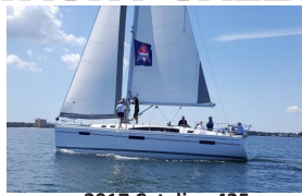
2017 Catalina 425 PRICE REDUCED $309,768