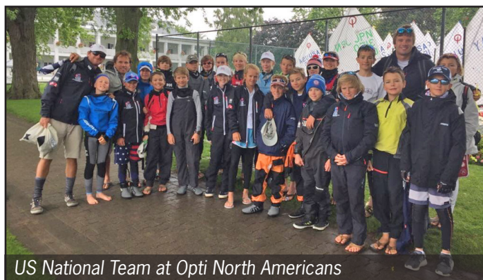
US National Team at Opti North Americans