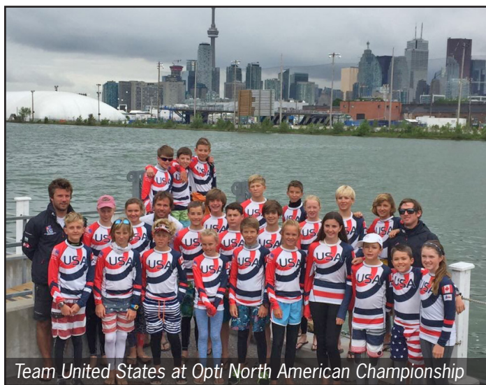
Team United States at Opti North American Championship