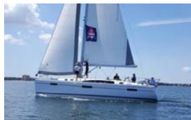
2017 Catalina 425 PRICE REDUCED $309,768