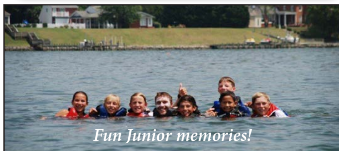
Fun Junior memories!

To Learn More Visit: www.FBYC.net and login Click on "Members" (red bar, upper right) Then click on "Dock Donation"