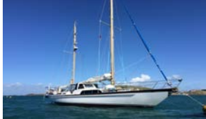
1972 Camper & Nicholson 48' $69,900