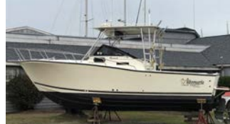
1993 Albemarle 26' $38,700

All Pricing Valid NEW OR USED Price Reductions 8/1/2017 JUST DO IT May Occur