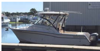
2007 Grady White 30' $110,000