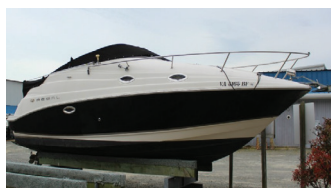
2005 Regal 26' $39,000