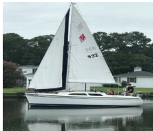
2007 Catalina 250 $23,500