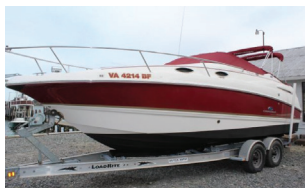
2005 Chaparral 24' $31,000