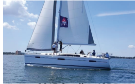
2017 Catalina 425 PRICE REDUCED $299,775