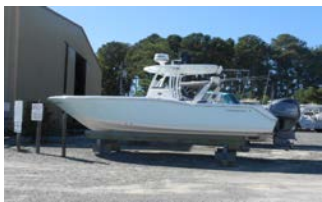
2015 Tidewater 25' $94,900