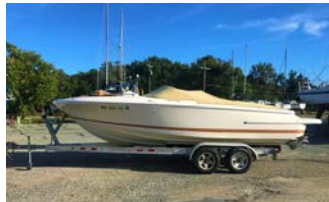
2011 Chris-Craft 23' $43,000