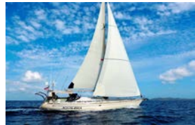
1999 Bavaria 50' $174,999