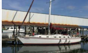
1985 Endeavour 35' $19,000