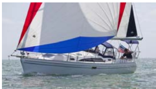
NEW! 2018 Catalina 315 $159,608