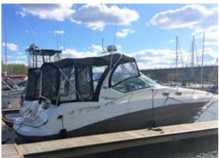
2006 Sea Ray 34' $114,500