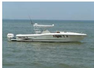
1989 Hydra-Sports 33' $63,995