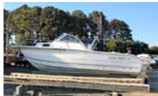
2003 Sea Pro 22' $12,999