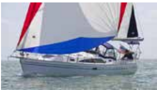
NEW! 2018 Catalina 315 $159,608