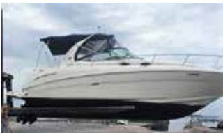
2004 Sea Ray 30' $53,900