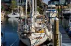
1980 Ta Chiao 35' $24,999