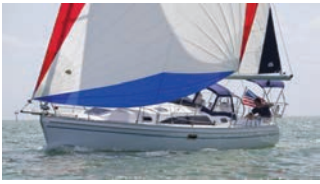
NEW! 2018 Catalina 315 $159,608