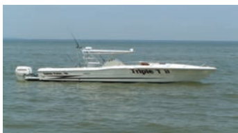
33' Hydra Sport 1989 $63,995