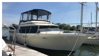
34' Tollycraft 1987 $44,999