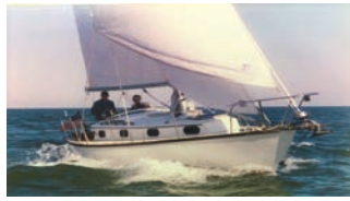
30' Cape Dory 1984 $29,500