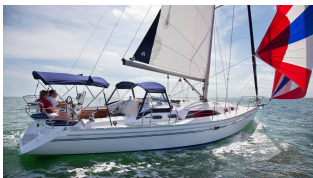
NEW! 2019 Catalina 385 IN STOCK