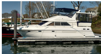
1996 Cruisers Yachts 36' $64,900