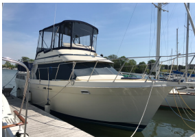
1987 Tollycraft 34' $34,900