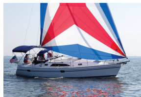
NEW! 2019 Catalina 355 IN STOCK