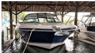
2008 Four Winns 28' $44,950