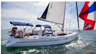
NEW! 2019 Catalina 385 IN STOCK