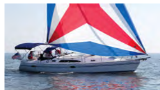
NEW! 2019 Catalina 355 IN STOCK