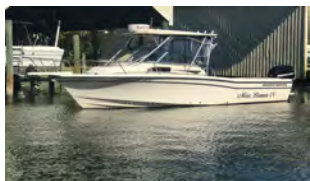
2001 Grady White 22' $34,995