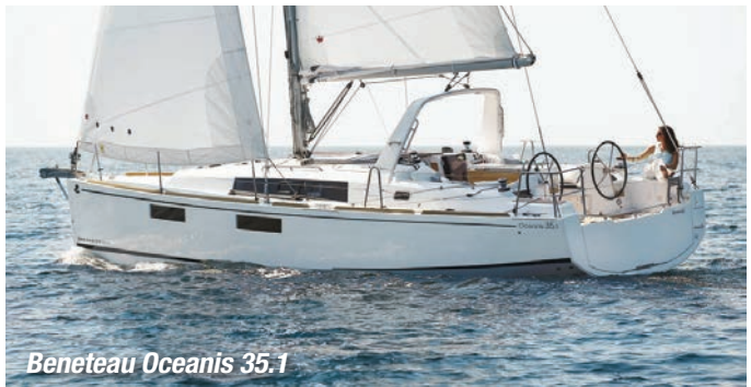
Beneteau Oceanis 35.1