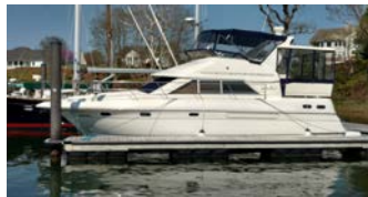
1996 Cruisers Yachts 36' $57,000