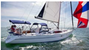
NEW! 2019 Catalina 385 IN STOCK