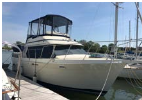
1987 Tollycraft 34' $29,000