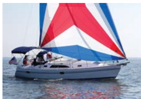
NEW! 2019 Catalina 355 IN STOCK