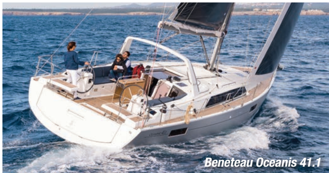
Beneteau Oceanis 41.1