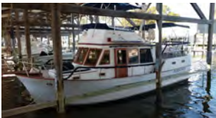
1984 Chein Hwa 34' $49,995