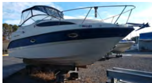
2005 Bayliner 26' $23,500