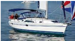
NEW! 2019 Catalina 355 IN STOCK