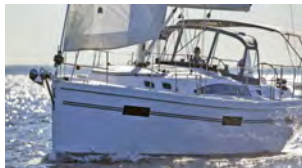
NEW! 2020 Catalina 425 ON ORDER