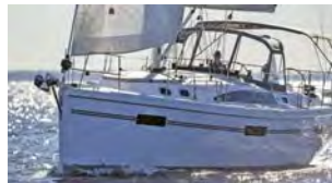
NEW! 2020 Catalina 425 On location Now