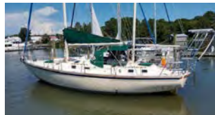
1980 Bruce Roberts 45' $64,900