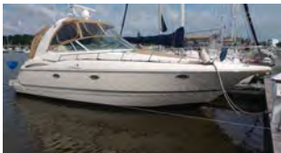
2007 Cruisers Yachts 37' $143,950