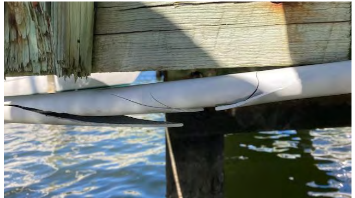
Cracked electrical conduit.

The original conduit support has totally failed, and the conduits have fallen down. I suspect that they were originally supported by non-corrosion resistant metallic supports that have long since corroded out. The eaten out cross braces were standard commercial design to add stiffness to the pier but because our water is so shallow, they serve no purpose as the pier is sufficiently stiff. We should consider cutting them off with a chainsaw when we do the electrical work.