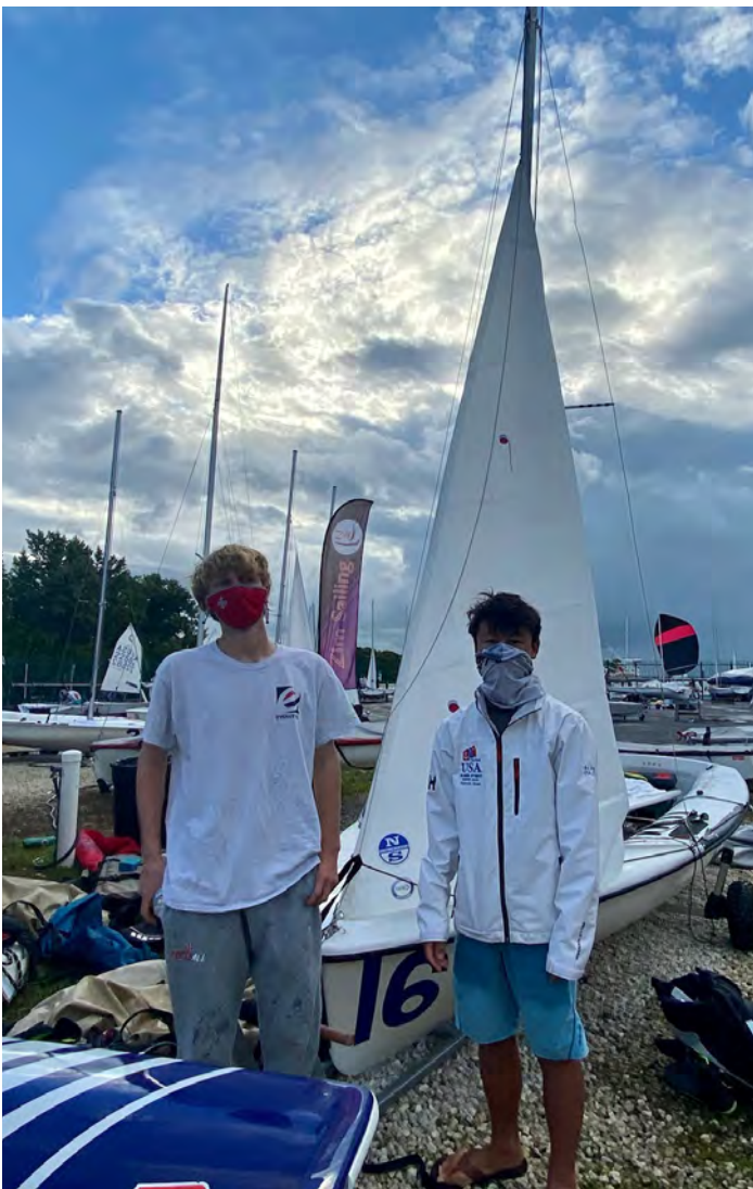
Junior C420s - Orange Bowl - Dec 2020