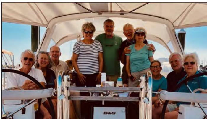
The crews gather in Chrisfield.