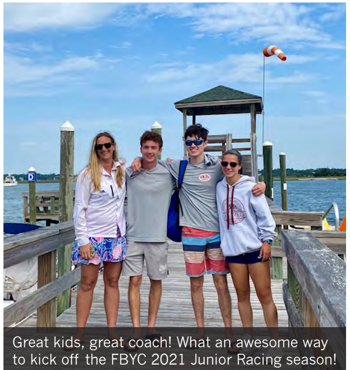
Great kids, great coach! What an awesome way to kick off the FBYC 2021 Junior Racing season!