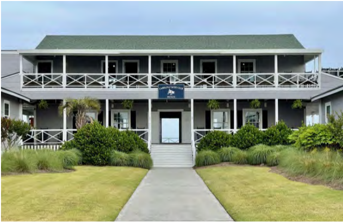
Carolina Yacht Club is a great venue, and they did a wonderful job hosting the event.