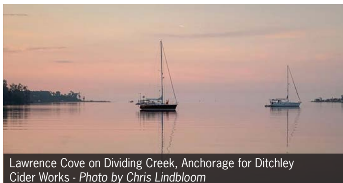
Lawrence Cove on Dividing Creek, Anchorage for Ditchley Cider Works