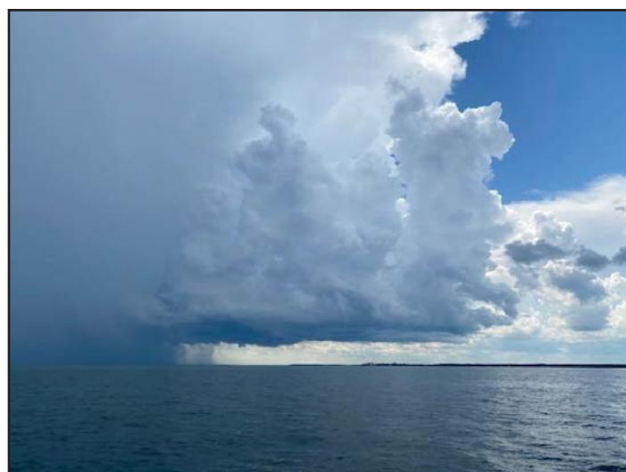
Sunday Thunderhead. Ditchley Cruise

Traveller II – engine problems. Attended by car.